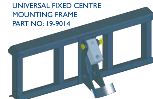
UNIVERSAL FIXED CENTRE MOUNTING FRAME PART NO: 19-9014